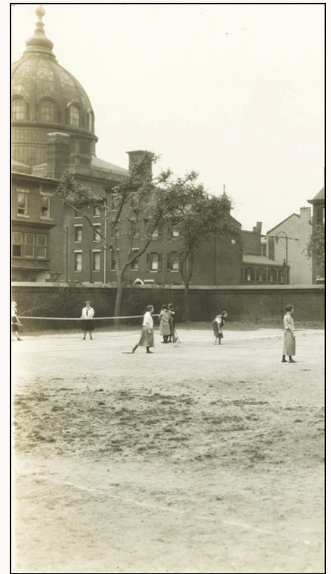
Above (left): An equestrian show from the 1930s, facing 16th Street. Above (right): Looking toward 17th Street. Below (left): Meeting with architects from Metcalfe Architecture & Design, Studio Ludo, and OLIN.